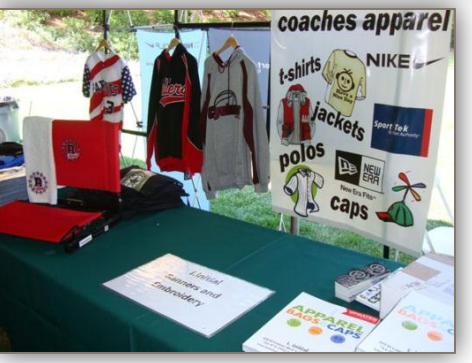
To view more photos and reviews of the California Coaches Conference, please take a look at the Conference Recap on our website: <a href="www.cui.edu/mcaa">www.cui.edu/mcaa</a>